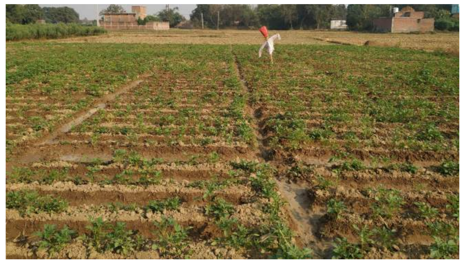
Fresh irrigated potato field in the Nadaon Village in Bihar.