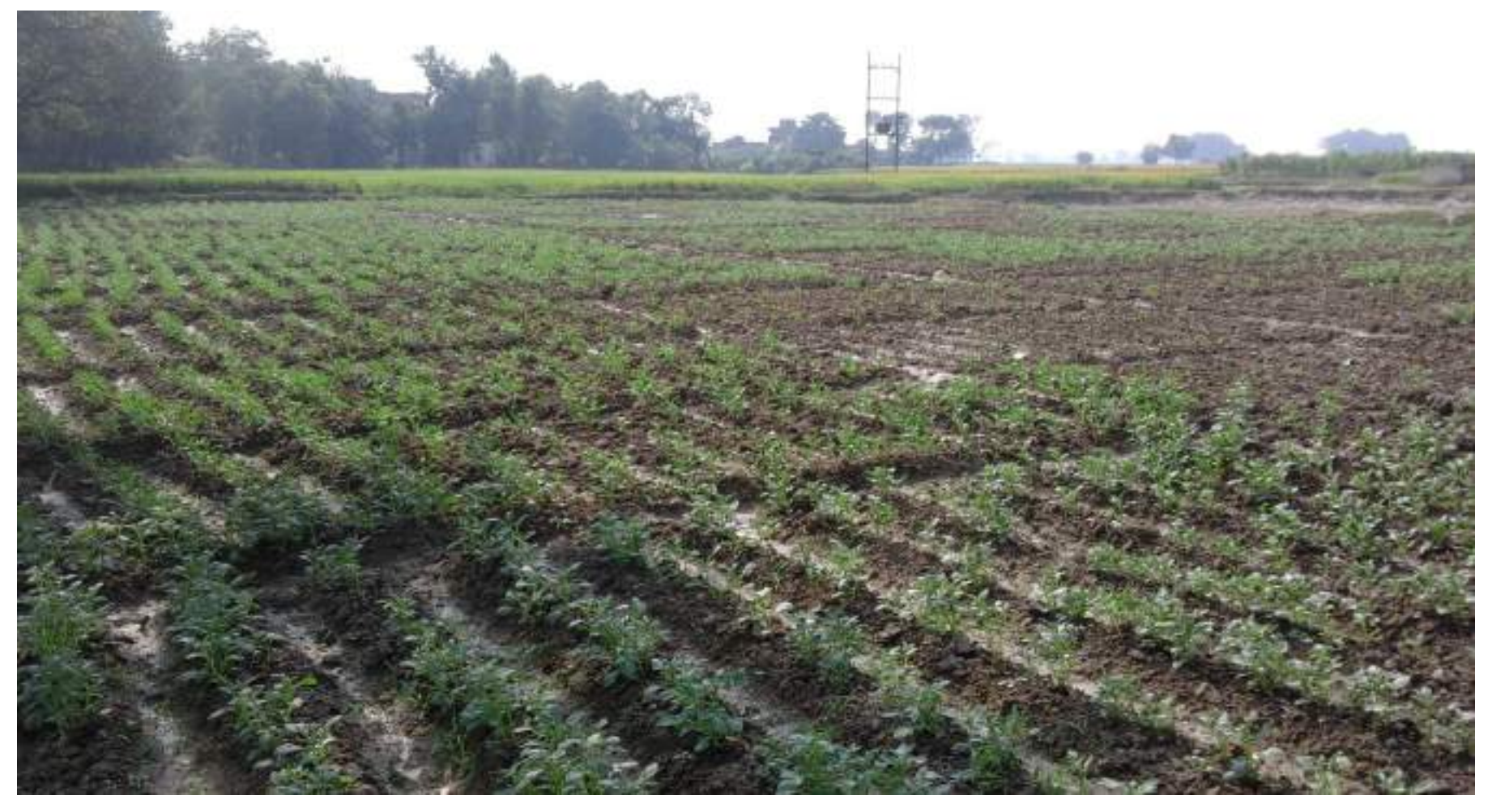
Potato field after irrigation in January month at Nadaon Village. .