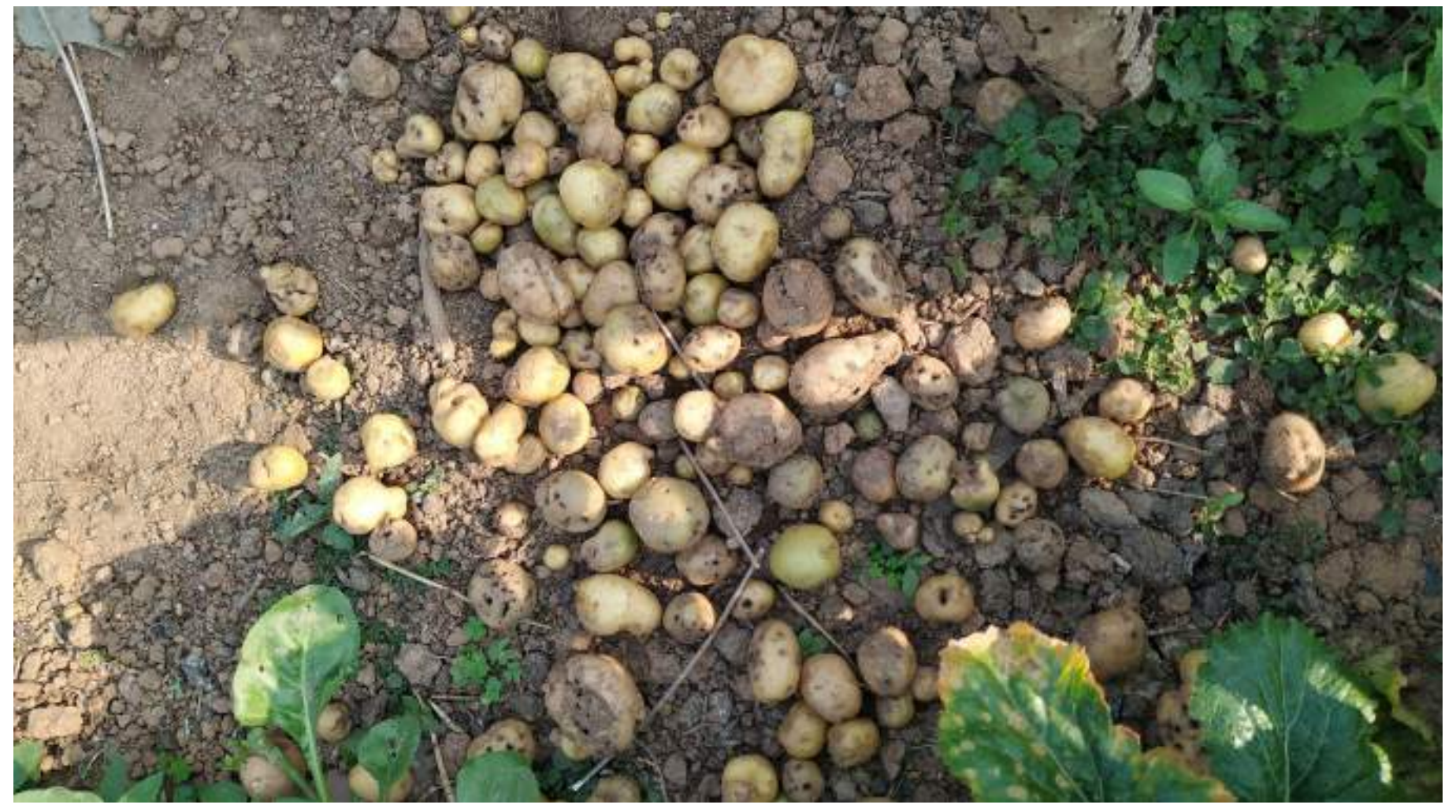
Potatoes in the field after harvest.