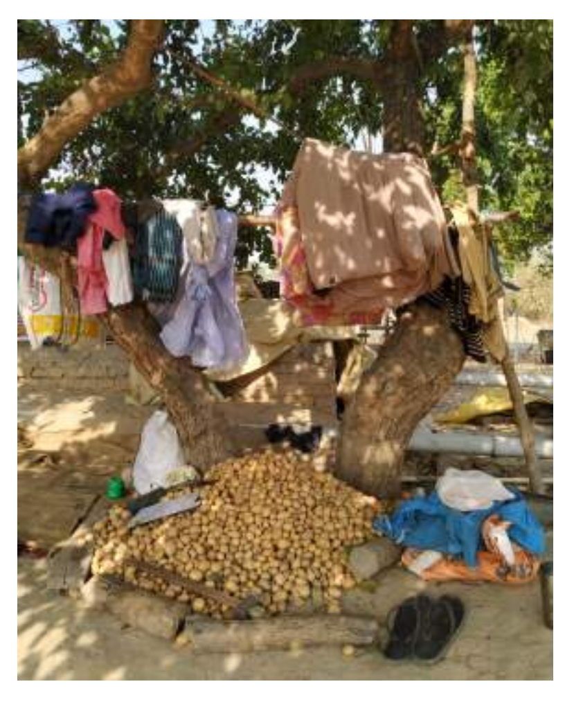
Potatoes kept in house after harvest.

I transformed, as taste, smell, colour and structure. I transformed through tools, time, profit, greed, machines, population and loaded hunger.