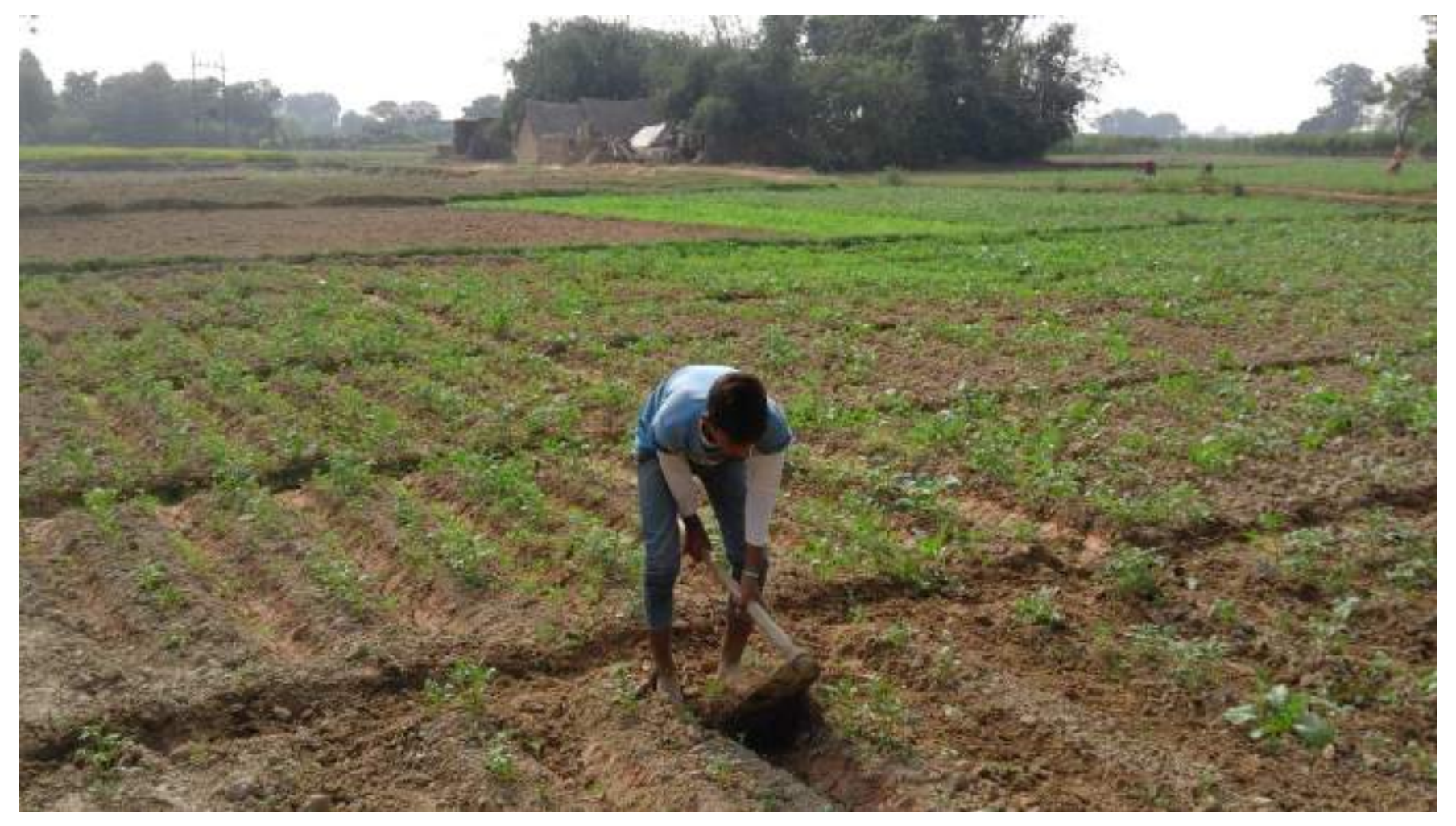
A young farmer working in his potato field in december noth at Nadaon village.