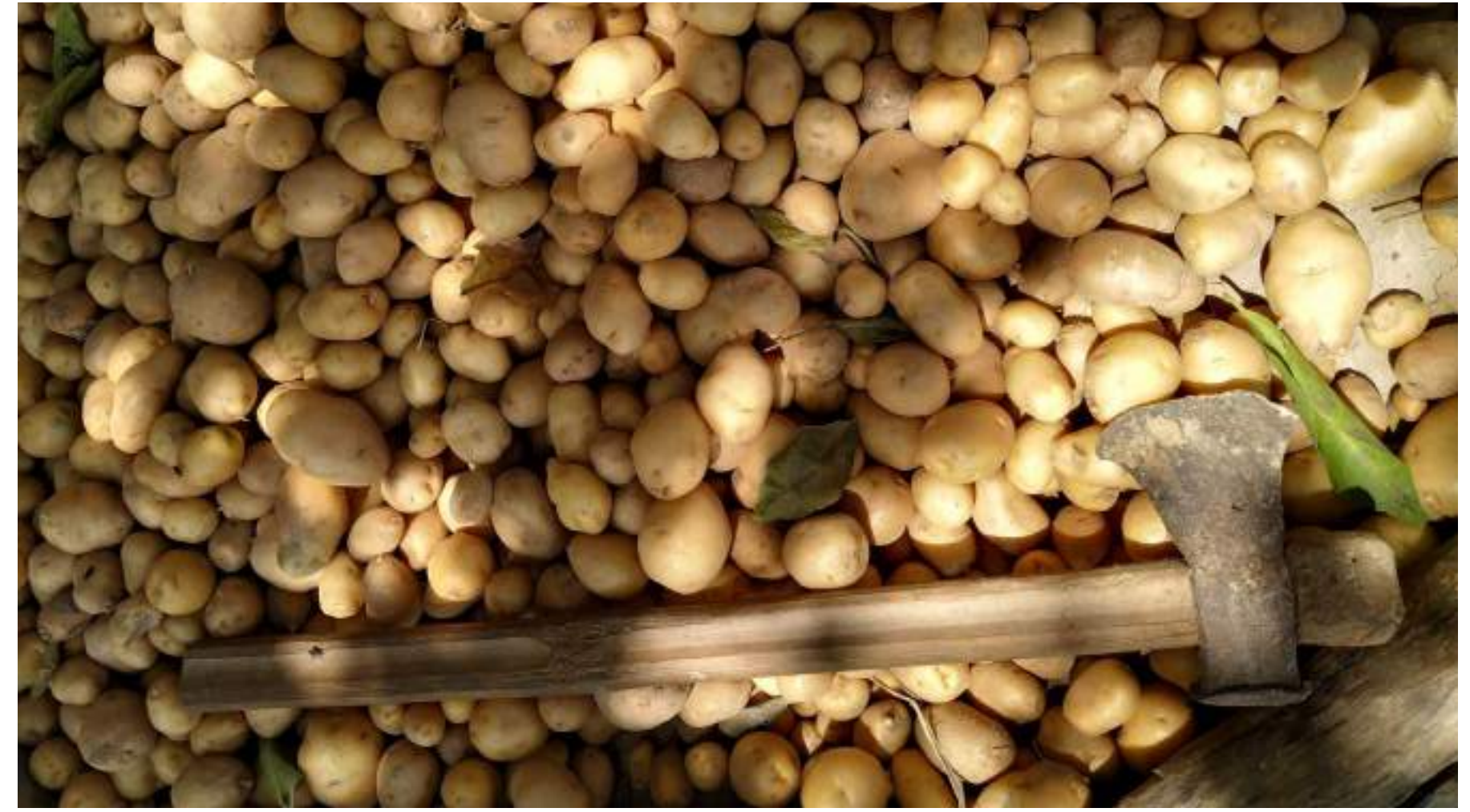
Potatoes kept after harvest.