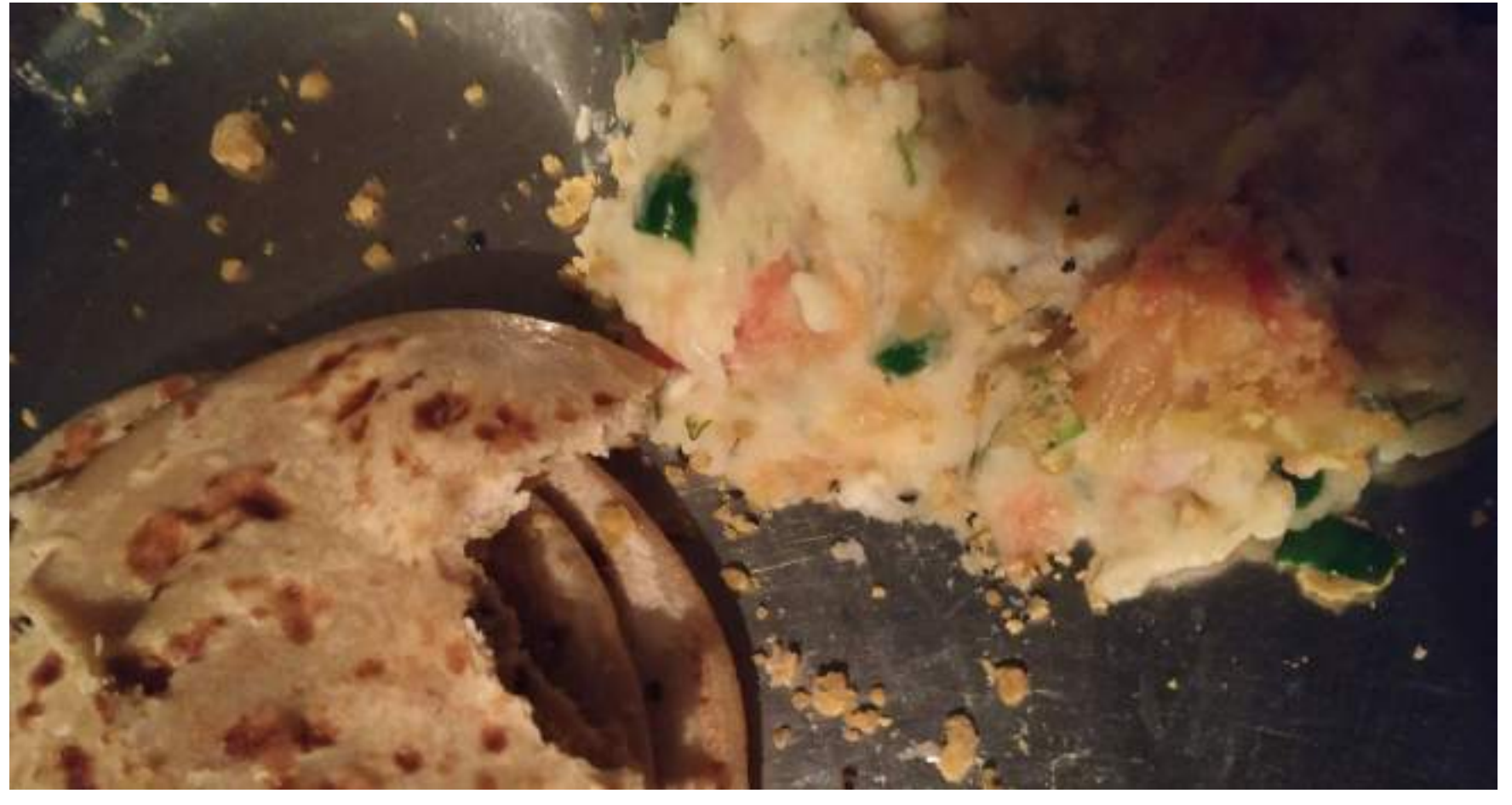
Alu chokha and Makuni are the dishes, very common in the Bhojpur region in India. The Alu chokha is roasted and boiled potatoes smashed with green chillies, roasted tomatoes and salt. People eat Alu chokha wilt Litti and Makuni. Litti and Makuni are the most popular dishes of the Bhojpuri community in Bihar.